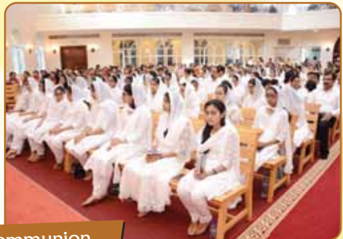
First Holy Communion