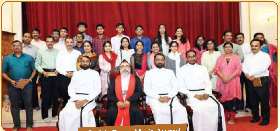
Parish Day - Merit Award