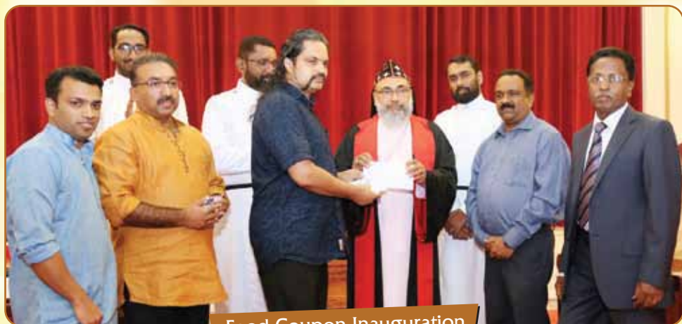
Food Coupon Inauguration