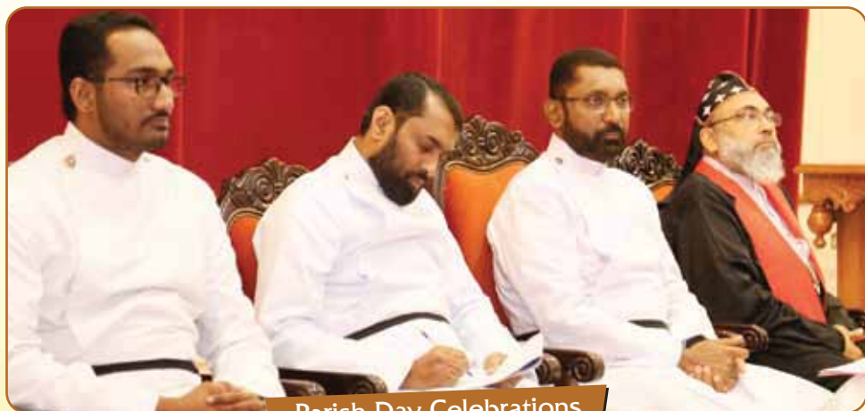
Parish Day Celebrations