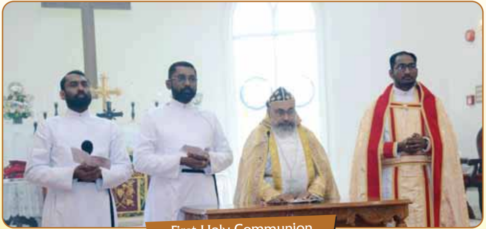
First Holy Communion