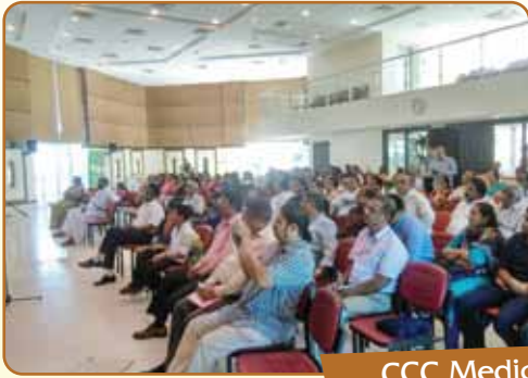
CCC Medical Seminar