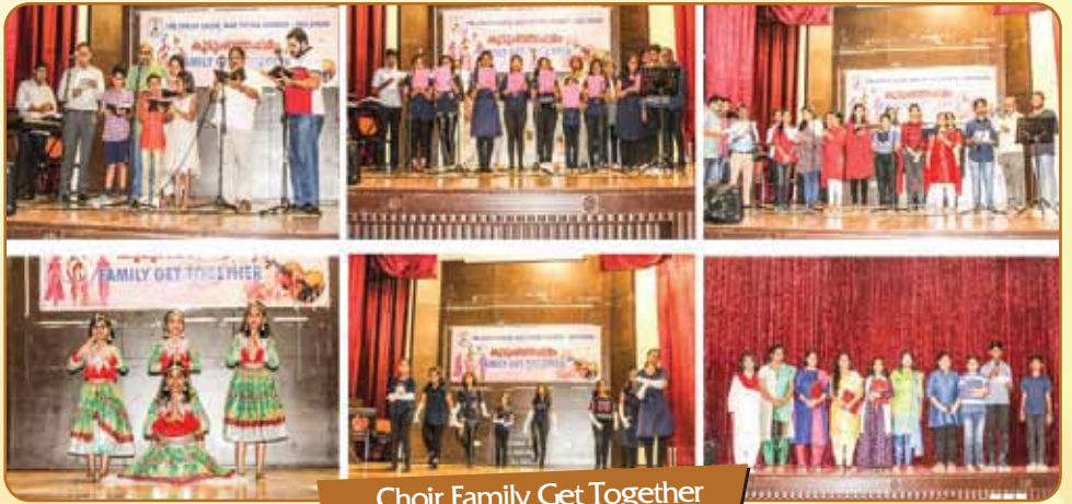
Choir Family Get Together