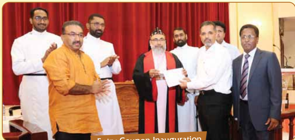
Entry Coupon Inauguration