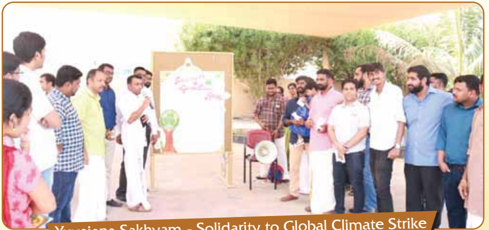
Yuvajana Sakhyam - Solidarity to Global Climate Strike