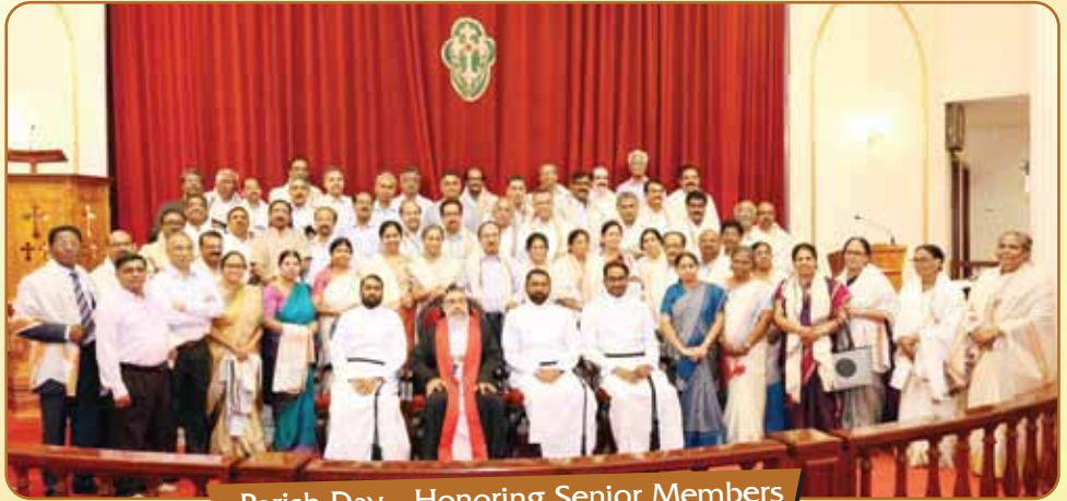
Parish Day - Honoring Senior Members